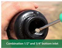
Combination 1/2" and 3/4" bottom inlet